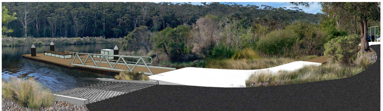
Artist's impression of Nornalup boat and paddle launch facility.

Regular updates are available on the project website at projects.trailswa.com.au . Simply click on the Great Southern tab or the trails network that you are interested in.