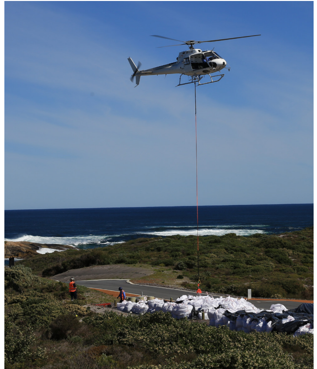
Helicopter operations at William Bay.

Funding for planning and construction of this project to link the Ocean Beach Surf Club to the Windfarm is allocated from the 2022-23 financial year. Initial scoping identified corridors with the Shire of Denmark however, corridor surveys and detailed design is yet to be undertaken before construction can commence in the 2022-23 financial year.